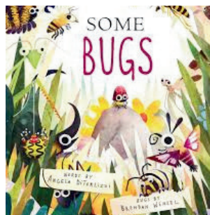
Some Bugs by Angela DiTerlizzi

Take a look at these awesome books shared at summer programs