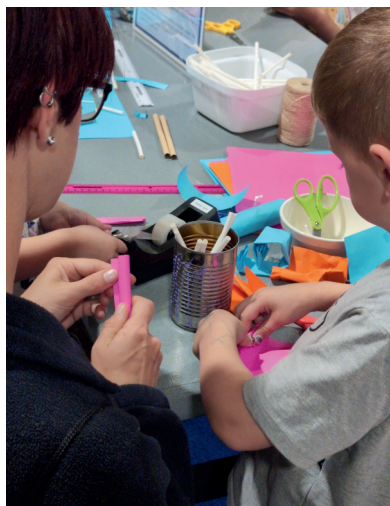
Taking risks - Exercising patience for finished product. The Bee Hotels were a lengthy process.