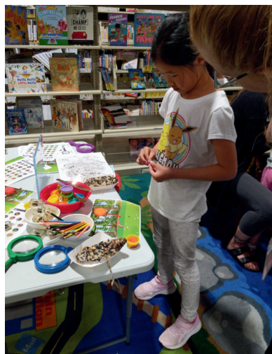
Learning through doing - watching her brother make a worm before attempting her own